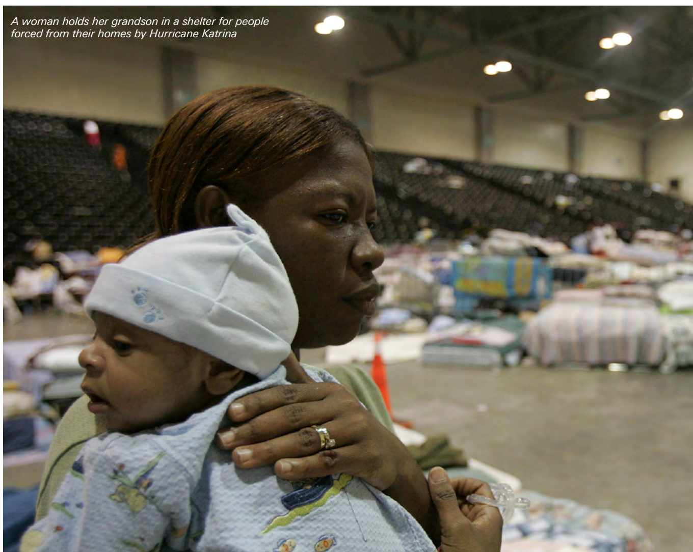
A woman holds her grandson in a shelter for people forced from their homes by Hurricane Katrina

mothers has been found to correlate negatively with a child's overall well-being, and notably their educational outcomes. In the Philippines for example, one of most vulnerable countries to climate risk, approximately 10 per cent of the country's workforce is working abroad as temporary migrants, and remittances from abroad account for 10.2 per cent of GDP. 74 The majority of these workers are women, and many have children that are not permitted to move with them. 75 Research has found that Filipino children are 5 per cent more likely to struggle at school when their mothers migrate abroad than if their fathers move, 76 with boys significantly more affected than girls. Further investigation is required to better understand how migration by one or both parents affects children's educational outcomes.