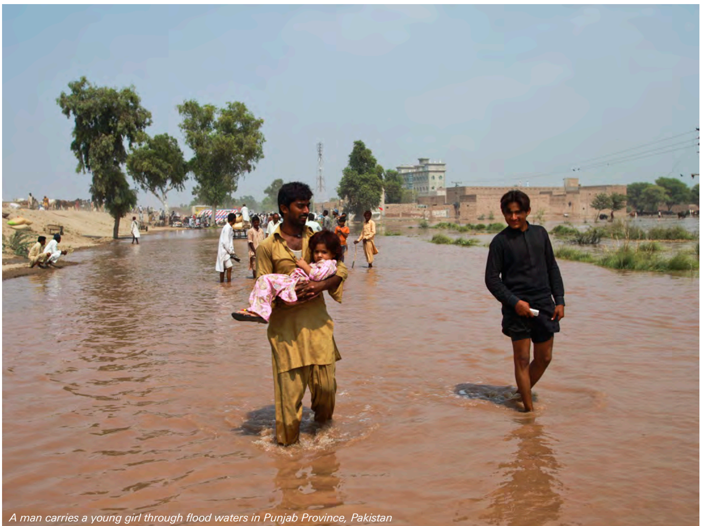
A man carries a young girl through flood waters in Punjab Province, Pakistan

As in all crises, children are the most vulnerable. Their physical, psychological and emotional immaturity and their reliance on adults for security means that they are exposed to a variety of unique and heightened risks – both from the initial climate-related harm that leads to displacement, and as part of the process of moving itself. Displaced children and their families lose much more than shelter when forced out of an area. They lose access to health care, education, livelihoods, social services and networks, religious services, political autonomy, and the security and identity associated with a sense of home. 5 Children that become separated from their parents and other family members are more likely to experience violence, exploitation or abuse. Long-term implications of psychological and physical childhood trauma can extend to impacts on their health, education and economic well-being over their lifetime. 6