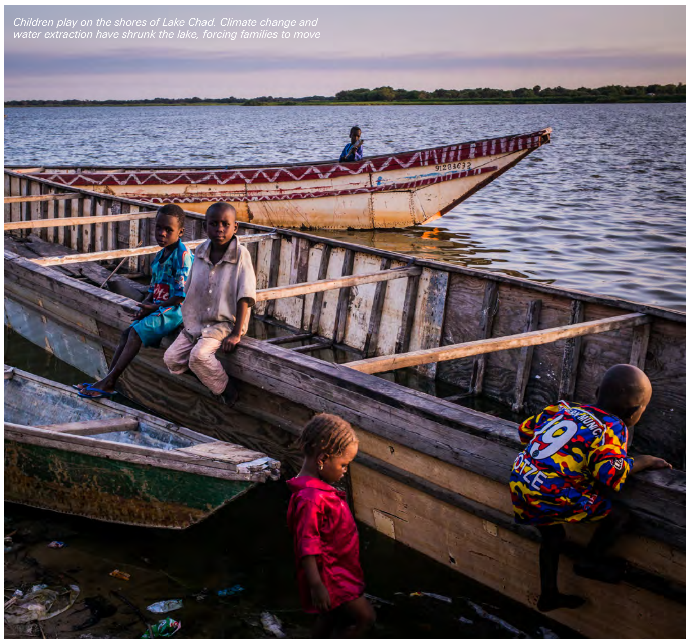
Children play on the shores of Lake Chad. Climate change and water extraction have shrunk the lake, forcing families to move

Several promising avenues across a multitude of processes exist. However, some are currently limited in their scope, or by the extent to which they consider children's rights.