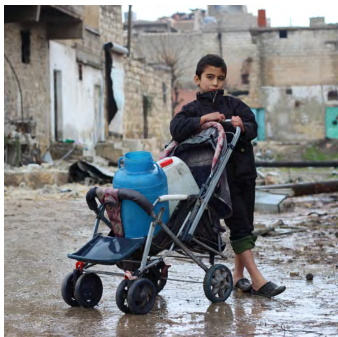
A boy collects water for his family in Aleppo, Syria. Conflict has raged in the country for six years.

Similarly, studies have traced a connection between climate change and the prolonged and devastating drought in Syria between 2006 and 2011, responsible for driving a mass exodus of farmers and rural families to Syrian cities. This shock, combined with a range of other economic, political and social grievances, has been cited as a contributing factor to the outbreak of unrest and the subsequent conflict. 97 The consequences to Syria's children of this humanitarian crisis – the largest in the world – are catastrophic and continue to severely violate the most basic rights of millions. 98