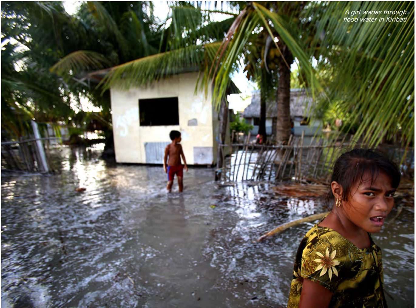
A girl wades through flood water in Kiribati