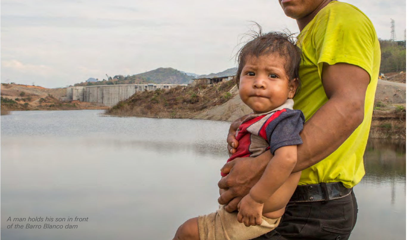
A man holds his son in front of the Barro Blanco dam

In Panama, the Barro Blanco dam is a 28.84 MW hydroelectric project that threatens to undermine the rights of the Ngäbe Buglé indigenous communities who live alongside the Tabasara River, including thousands of children. Several settlements will be flooded, making relocation necessary and endangering 5,000 indigenous peoples' subsistence livelihoods and water sources. The area under threat contains a school, cemeteries, sacred petroglyphs and medicinal plants which are used to cure snakebites. The construction company failed to undertake due diligence, to consult the community or to obtain their free, prior and informed consent before it began operations. 106 During subsequent clashes between Ngäbe Bugle protestors and security forces, children were beaten and a 13 year-old girl was allegedly raped. 107 In November 2016, the Panamanian Government withdrew its registration of the dam under the UN Framework Convention on Climate Change's (UNFCCC) Clean