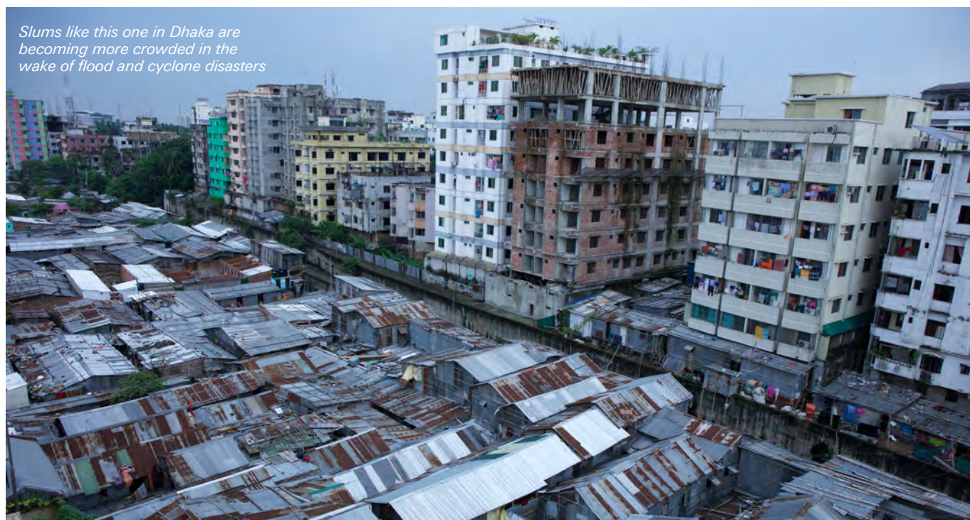
Slums like this one in Dhaka are becoming more crowded in the wake of flood and cyclone disasters

Furthermore, these destinations may themselves be highly exposed to climate-related impacts. They may be positioned on flood plains or in vulnerable coastal areas, for example. 29 According to a UNHCR survey in 2015, refugees and internally displaced persons were exposed to 150 disasters in 16 countries between 2013 and 2014, illustrating their vulnerability to disasters associated with natural hazards including floods, severe weather, landslides and fires. High population density was found to be a key determinant of vulnerability and the level of risk. 30