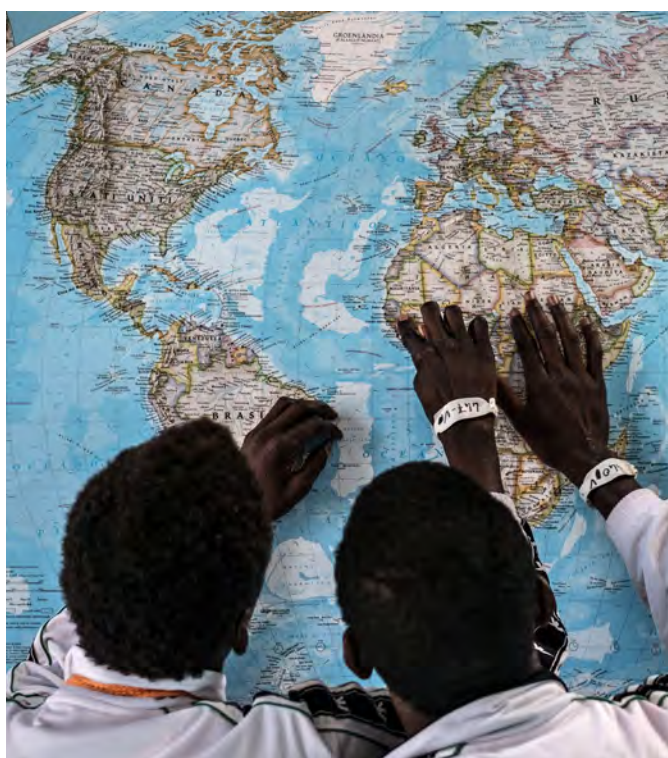
Two young asylum seekers study a world map