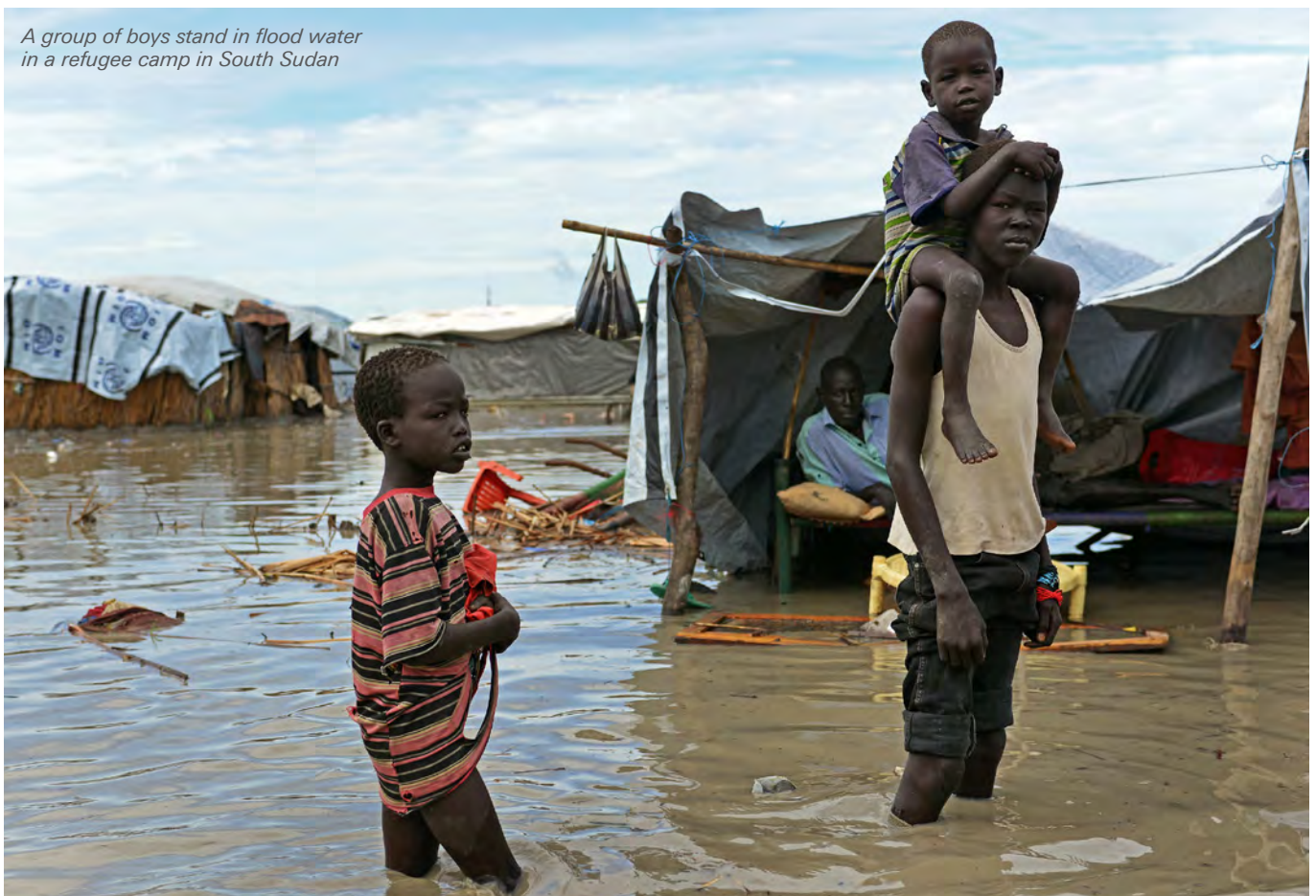
A group of boys stand in flood water in a refugee camp in South Sudan

The extent to which climate-related displacement and migration will undermine children's rights or increase children's opportunities and well-being will depend on their rights being considered at all stages of planning and response strategies and actions taken by States and other actors. This includes, notably, their right to be heard. As one of the most sizeable and vulnerable groups affected, involving children in decision-making and incorporating their views will be essential to establishing effective, legitimate and sustainable interventions.